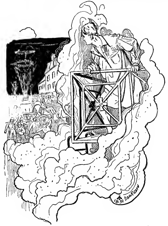
"MUST HE GO DOWN IN HIS SPECTRAL NIGHT DRESS?"

The cowboy hat and the coat but half on made him too much of a centre of attraction for comfort, although nothing could be more profoundly respectful,